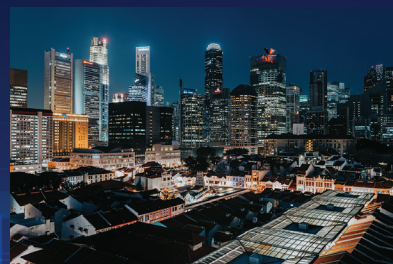
» Energy consumption