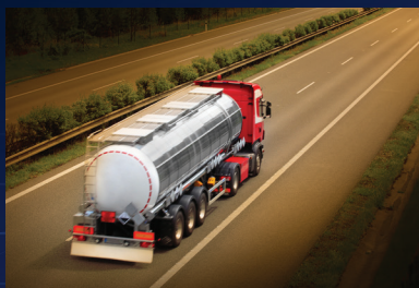
» Service replenishment