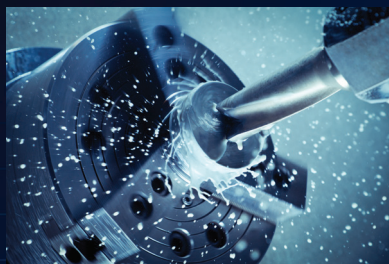
» Predictive maintenance

Evolving with IIoT publish/subscribe messaging protocols, Define IIoT solutions include preventative maintenance, energy monitoring, product lifecycle insights, and production optimization which lets you have the benefits of IoT connectivity without losing the reliability of Cloud edge processing.