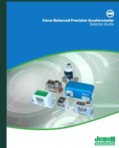
Force-Balanced Precision Accelerometer Selector Guide