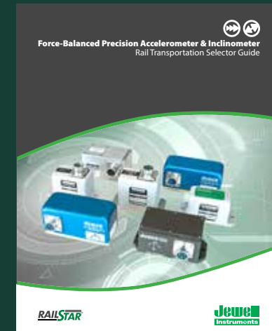
Rail Transportation Selector Guide