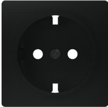
DELTA i-system soft black SCHUKO socket outlet 10/16 A 250 V With screwless Connection terminals cover plate 55 x 55 mm