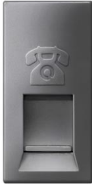
DELTA m-system Modular jack socket CAT3 RJ11 6/4 with shutter carbon metallic