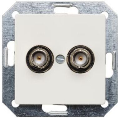
DELTA i-system titanium white BNC plug socket 2-fold, 75 ohm cover plate 55 x 55 mm